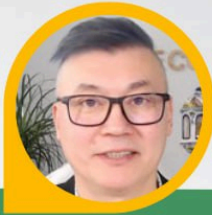
Developed Country NGO Delegation