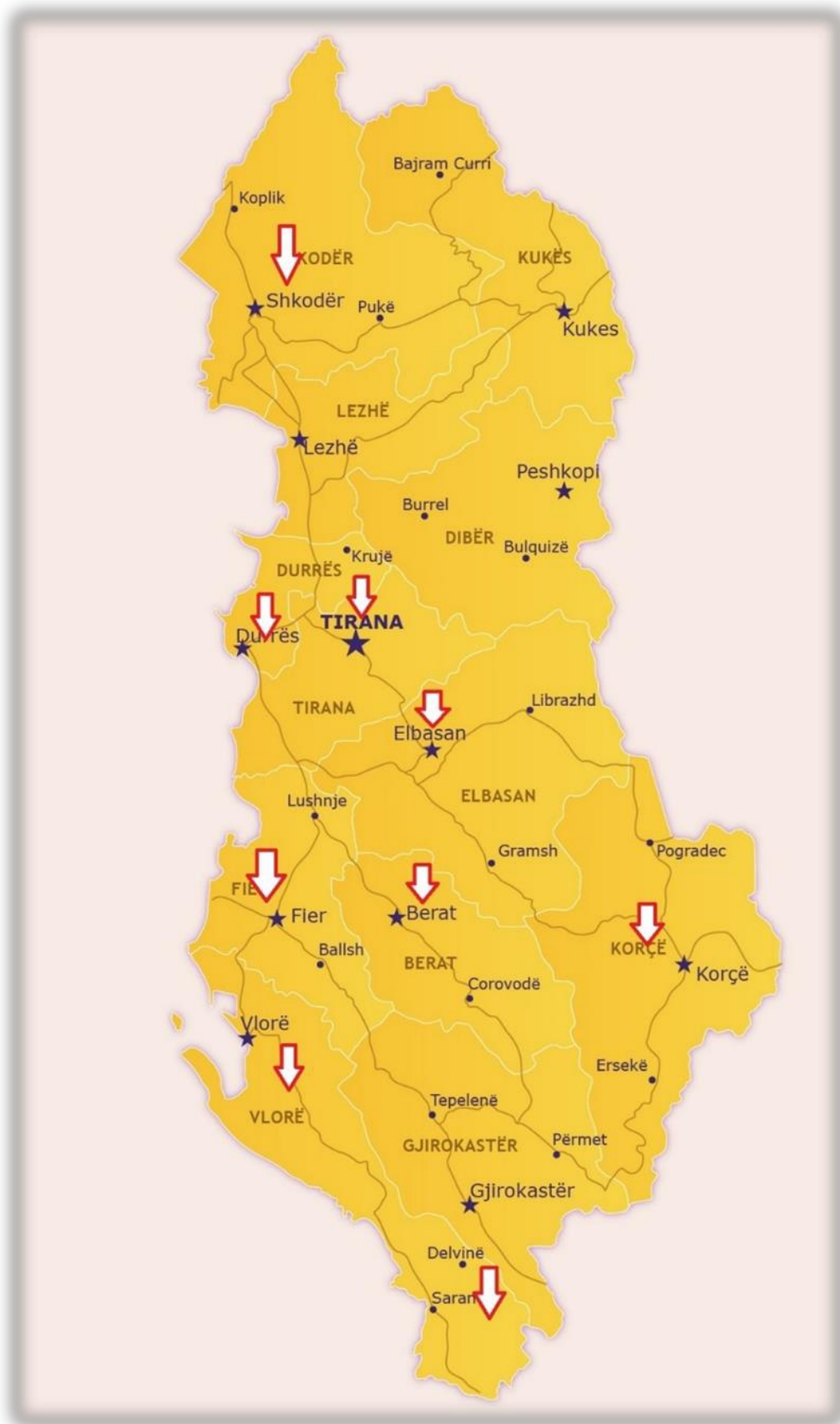
Figure 3. Map of the location of OAT sites in Albania.