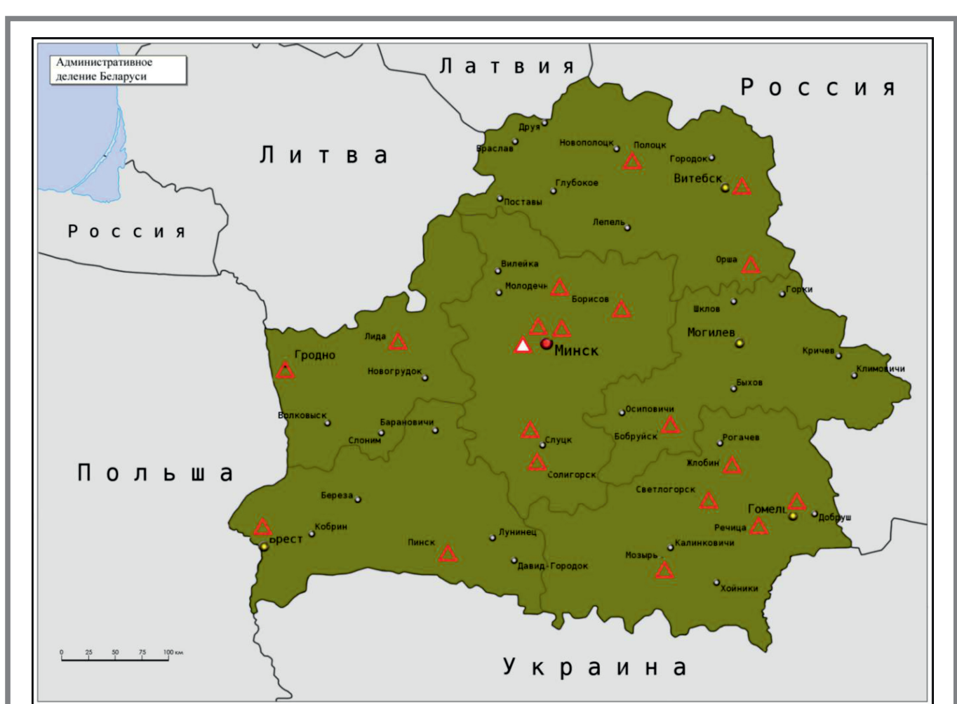
Figure 2. Map of OAT service sites in Belarus

Opportunities and way forward. In the context of transition, there is a feasible opportunity for improving the geographic coverage of the OAT programme. A need may arise to analyse the work of sites serving the lowest number of clients. It is important to make rational decisions, discover the reasons for low coverage in certain regions and not to rush to close any existing sites.